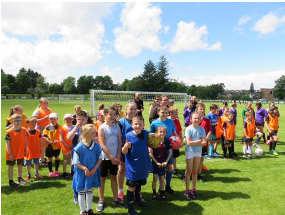
East Kilbride Old Parish Church Team